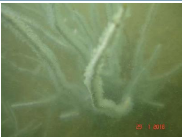
Soft coral at Survey Station D7