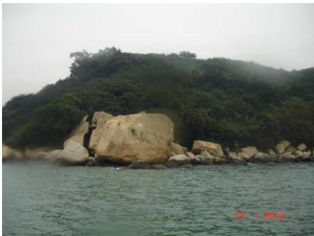
Rocky coastline at Sha Chau (Survey Station D9)