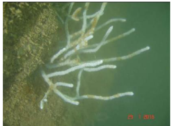
Soft coral at Survey Station D6