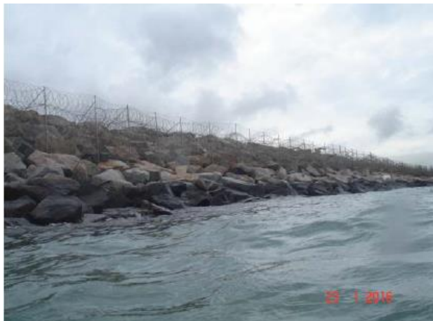
Artificial Sloping Seawall with Boulders