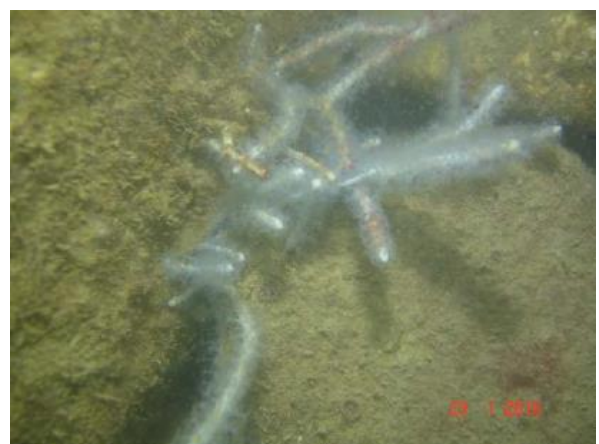
Soft coral at Survey Station D8