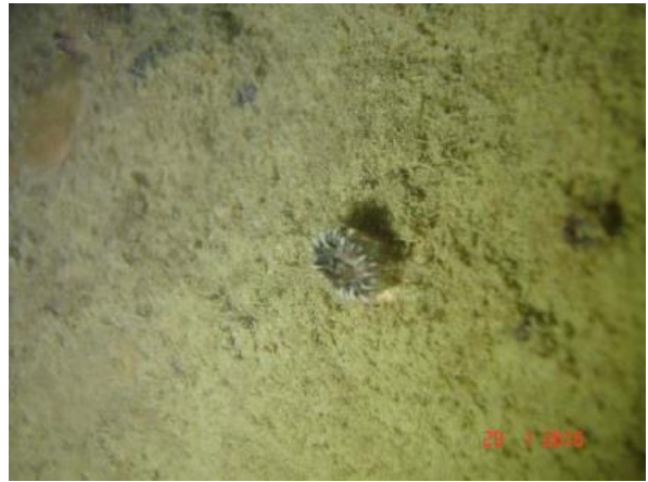
Paracyathus rotundatus at Survey Station D7