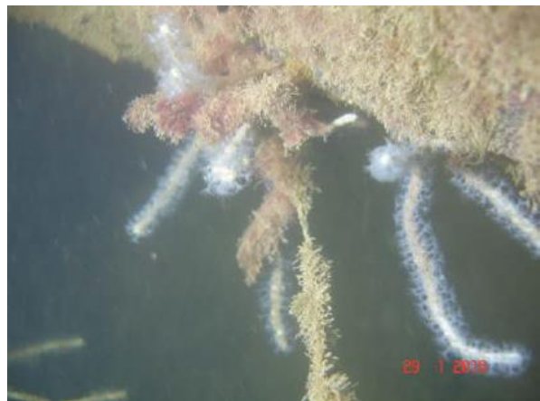
Guaiaigorgia sp. with partial mortality at Survey Station D9