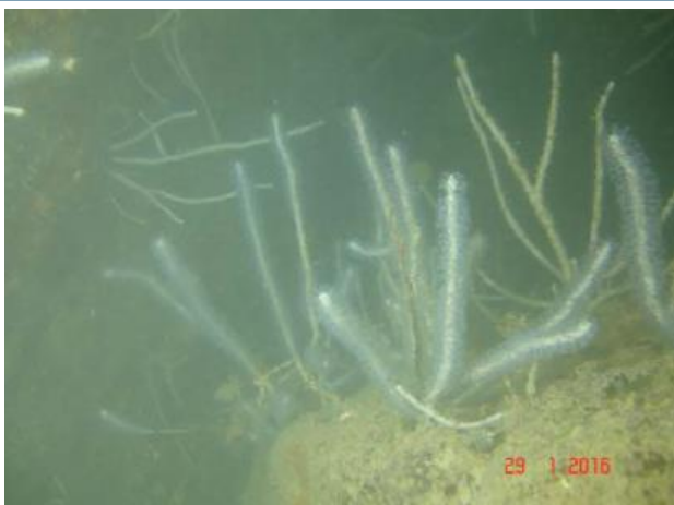
Guaigorgia sp. at Survey Station D5